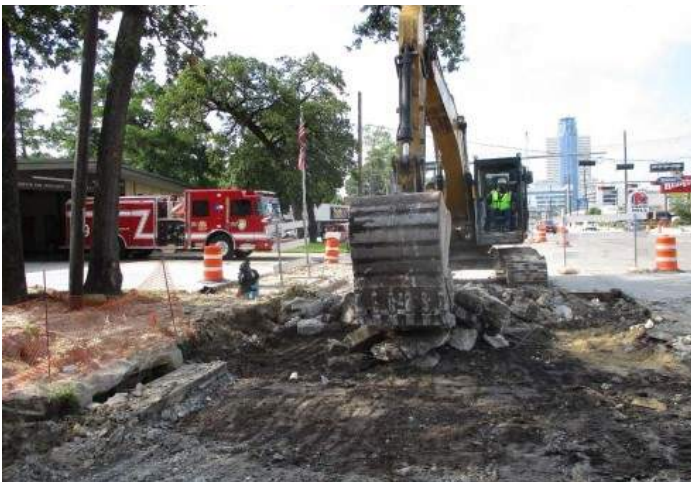
Removal of existing pavement on east side of Gessner Road