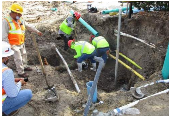
Installation of water line connections and valves