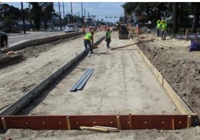
Forming work for pavement installation on east side.