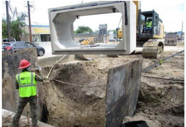
RCB installation on the east side of Gessner Rd