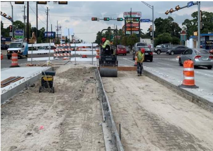
Soil compaction for travel lane - phase 5