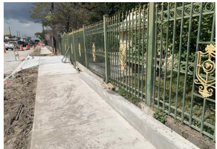
Completed Sidewalk and retaining wall on east side.