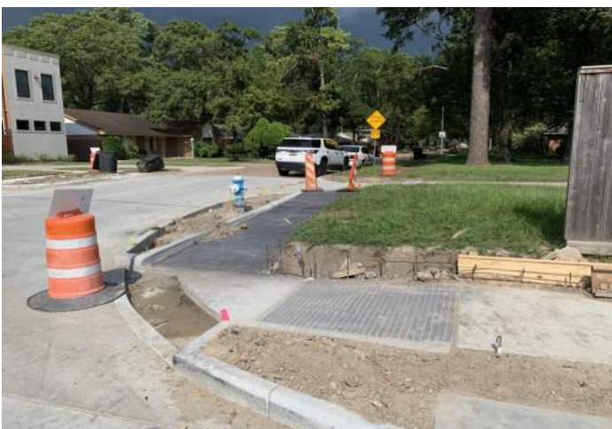
Ramp installation and retaining wall forming work