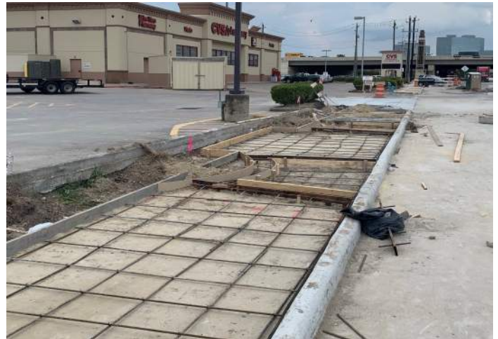
Forming work for sidewalk installation on east side.