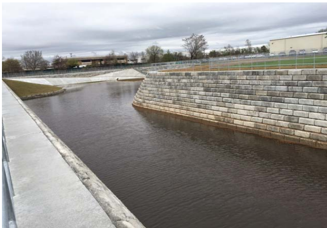
Basin after March 9 -10, 2016 rain event

* For more information please refer to TIRZ 17 website