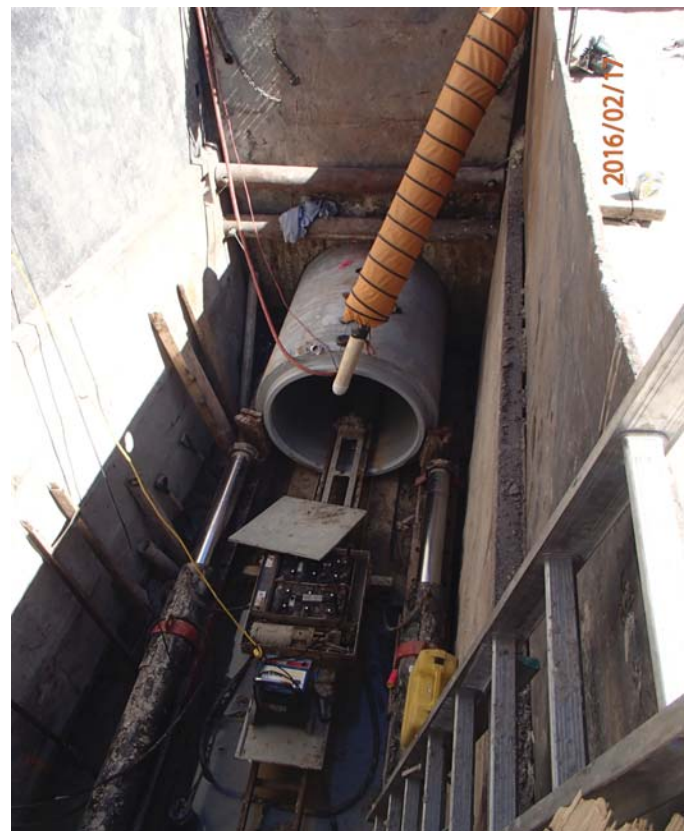
48-inch storm drain installation to Spillers Ln. cul-de-sac