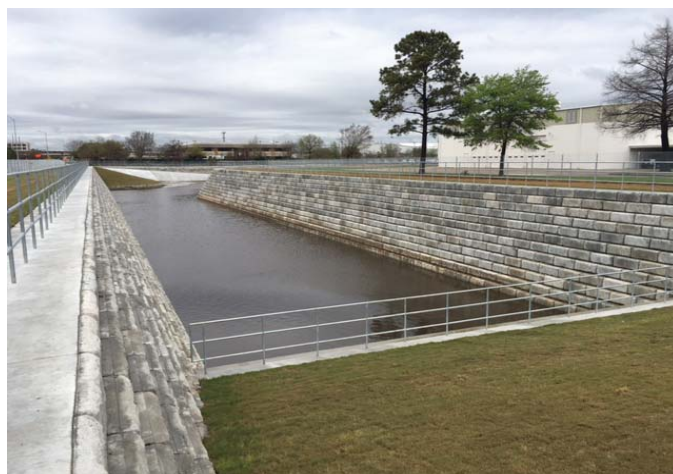
Basin after March 9 -10, 2016 rain event