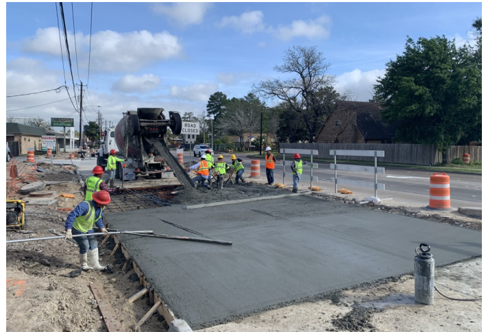
Pavement installation continues on the west side of Gessner Rd