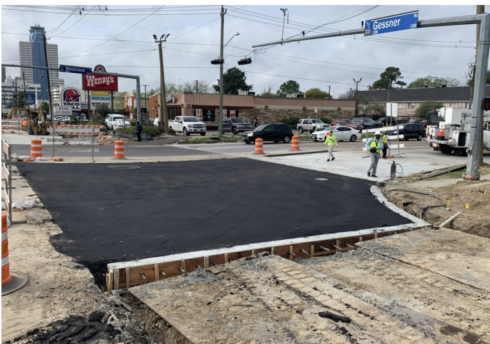
Temporary asphalt installed at Westview