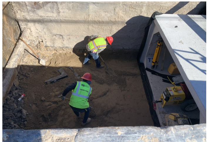
8-FT x 5-FT RCBs installed north of Westview