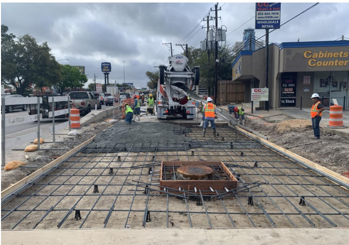
Forming and Rebar for pavement installation.