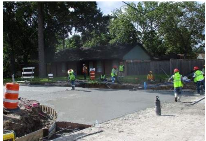
Finished concrete—intersection of Cedardale