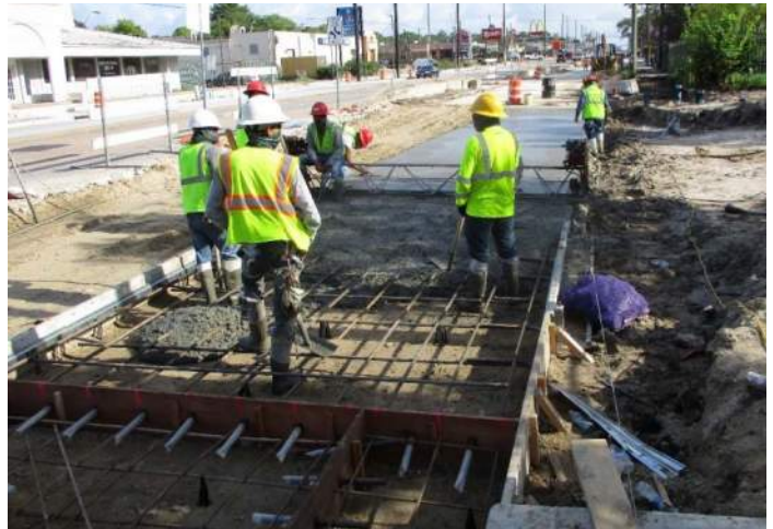
Concrete Pour on east side of Gessner Road.