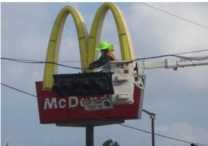
Adjusting traffic signal in preparation for traffic control changes.