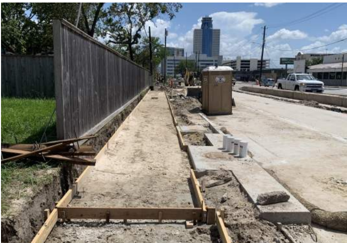
Forming work for sidewalk installation on east side.