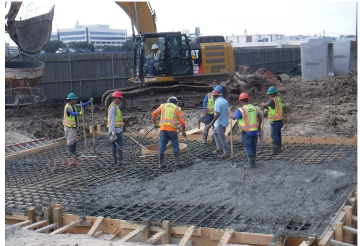
Junction Box Installation