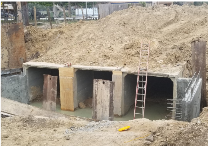
Triple 8-FT x 8-FT Rows of RCBs east of Witte Road