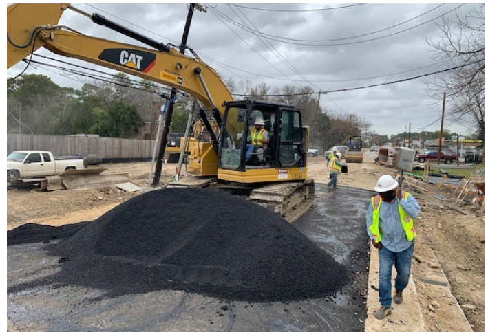
Type D Material being placed